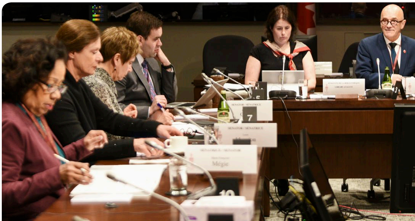
From left to right: The Honourable Marie-Françoise Mégie, Lucie Moncion, Raymonde Gagné and René Cormier (Chair), accompanied by committee staff.

The Senate Committee is very proud to table the fifth and final report of its series on modernizing the Act. In total, it has heard more than 100 proposals addressing all parts of the Act and suggesting the addition of new parts. These proposals come from more than 300 witnesses and 72 briefs and follow-ups from various individuals and organizations (Table 1). Between April 2017 and April 2019, the Senate Committee dedicated 44 meetings to this study and travelled to three provinces to meet with stakeholders.