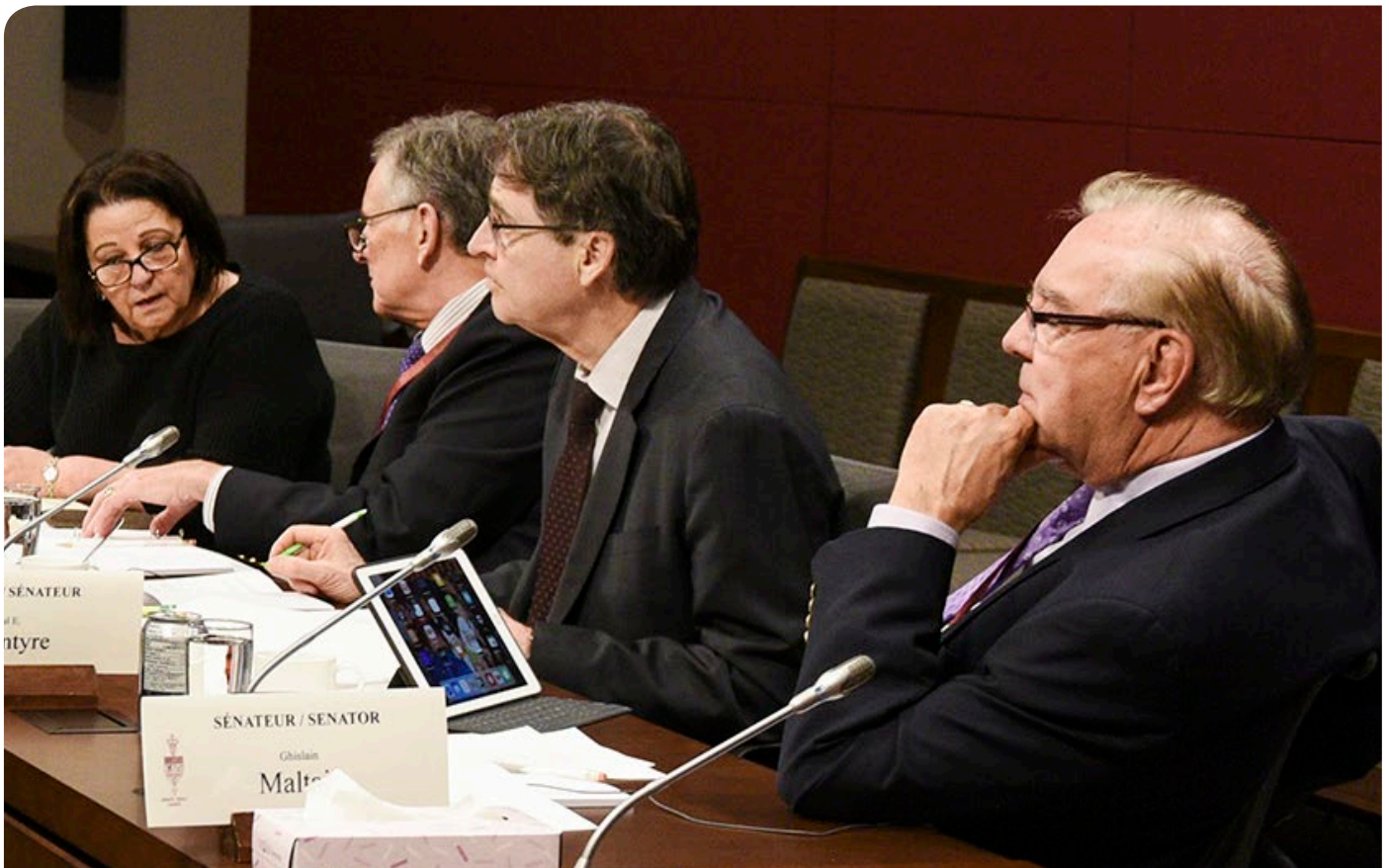
From left to right: The Honourable Rose-May Poirier, Larry W. Smith, Paul E. McIntyre and Ghislain Maltais.

The fourth interim report discussed a number of points specific to legal translation. 187 As we have seen, complying with section 20 of the Act often comes down to the financial considerations of translation, and that is why some people have