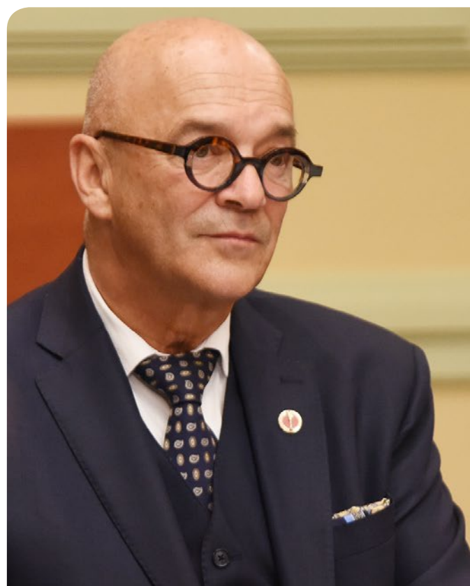
The Honourable René Cormier, Chair of the Senate Committee.

The guide prepared for federal institutions by Canadian Heritage to help them implement "positive measures" addresses the responsibility to consult communities and to document measures taken. 32 The Commissioner's memorandum of fact and law tabled with the Federal Court of Appeal maintains that "positive measures" must be interpreted through this guide, and in keeping with Parliament's intention. 33 Some federal institutions the Senate Committee met with supported the idea of clarifying the definition of "positive measures" in the Act, including representatives from Immigration, Refugees and Citizenship Canada (IRCC). 34