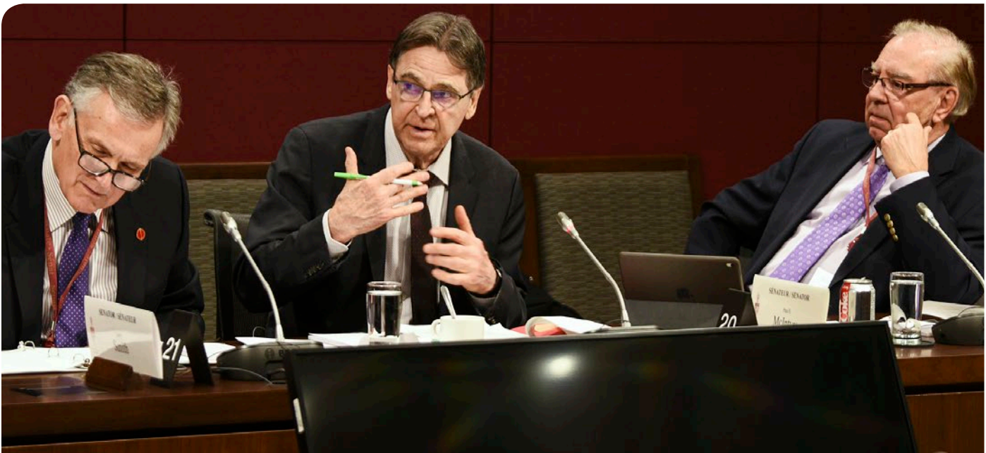
From left to right: The Honourable Larry W. Smith, Paul E. McIntyre and Ghislain Maltais.

Fédération des conseils d’éducation du Nouveau-Brunswick, Brief , 31 January 2019, para. 43.