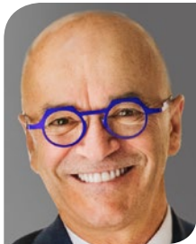
The Honourable René Cormier Chair*