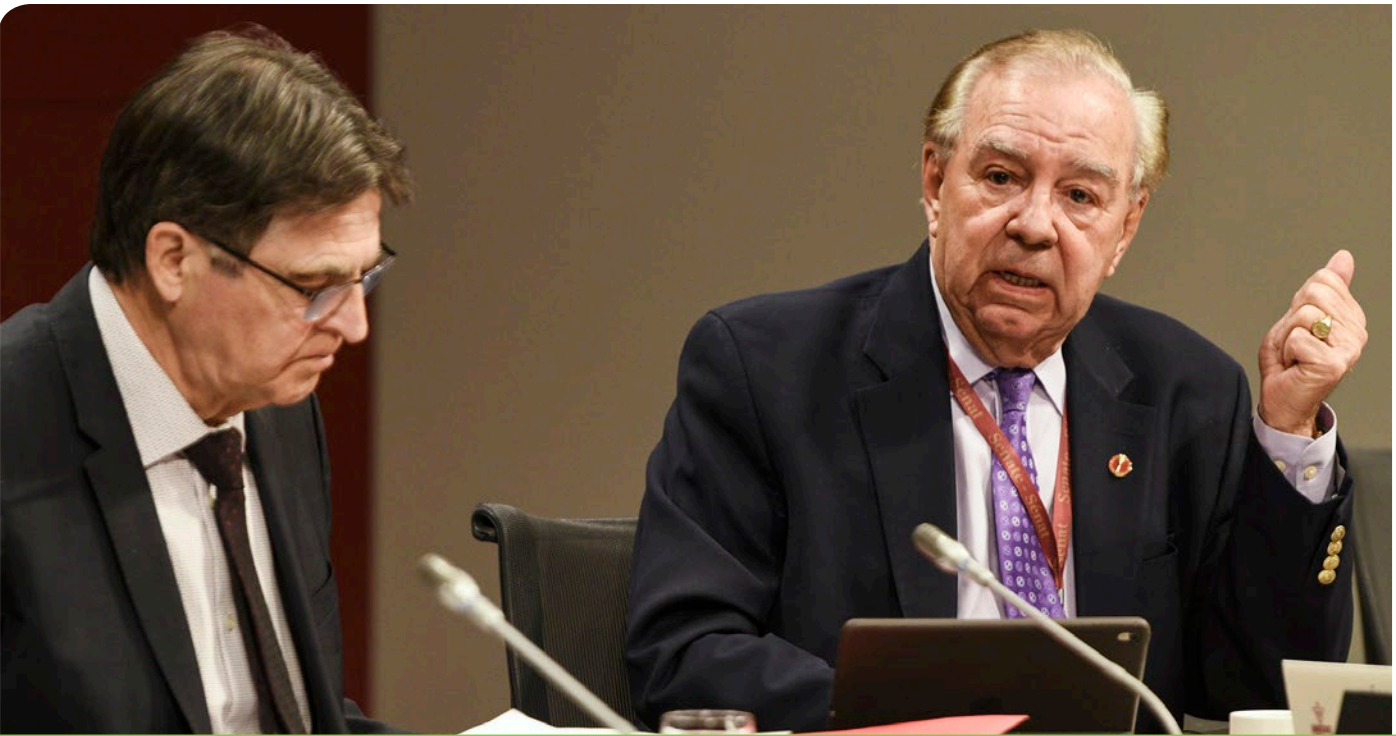
From left to right: The Honourable Paul E. McIntyre and Ghislain Maltais.