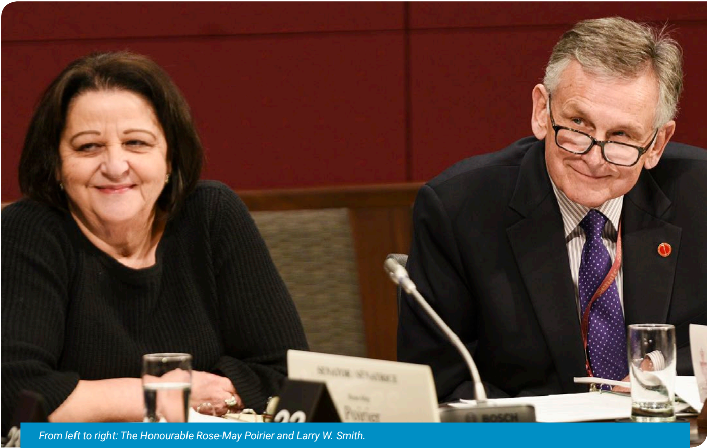
From left to right: The Honourable Rose-May Poirier and Larry W. Smith.