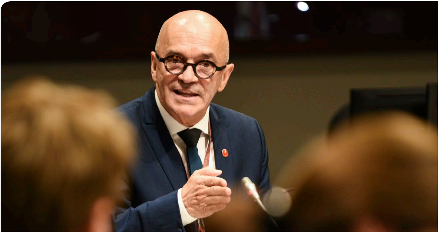
The Honourable René Cormier, Chair of the Senate Committee.

Chapter 3 presents the Senate Committee's observations and provides additional insight regarding the recommendations to the federal government for updating the Act. The Senate Committee is making 20 recommendations, grouped under four main themes: leadership and cooperation, compliance, enforcement principles and judicial bilingualism .