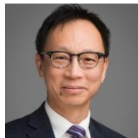
Yuen Pau Woo