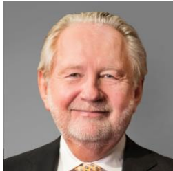
The Honourable Peter Harder, P.C. Deputy Chair