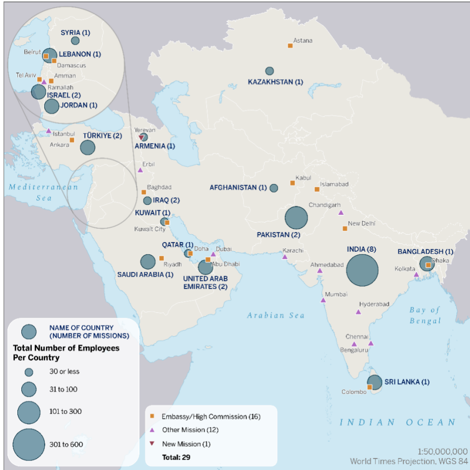
Map 5. Canada's Missions in Central Asia, South Asia and West Asia

Note: The Canadian Embassy in Afghanistan has temporarily suspended operations.