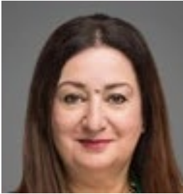
The Honourable Salma Ataullahjan Chair