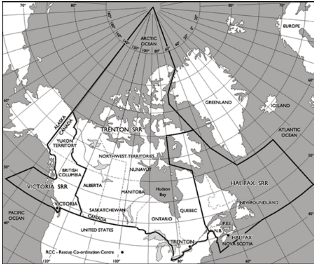
Map 3 – National Defence Search and Rescue Regions